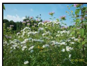
Virginia Mountain Mint: with rather flat topped flowers, this mountain mint is distinguished by narrow and toothless leaves