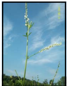
Culver's Root: the culver's root is a tall plant found in woods and thickets. It has white tube-like flowers and sharp toothed leaves