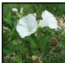
Hedge Bindweed: this white flowering plant is part of the morning glory family recognized by its opening white flowers and arrowhead leaves