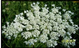
Queen Anne's Lace: a very recognizable wildflower. It is classified by its soft, delicate and lace like flower