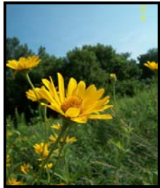
Prairie Golden Aster: the golden flower blooms in late summer and is distinguished by its smaller leaves with variable petals