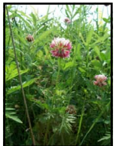
Clover: a low to the ground plant, you will recognize this by its small orb like purple flowers