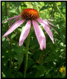
Purple Cone Flower: this 2 to 3 foot tall purple flower has a cone-like center filled with rough teeth