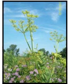
Wild Parsnip: the wild parsnip bears a close resemblance to Queen Anne's Lace but differs in its yellow coloring