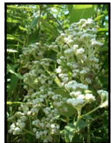
Wild Quinine: a smaller plant that holds white ray-like flowers and large toothed leaves