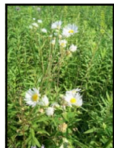
Daisy Fleabane: this daisy like flower is quite small and starts blooming in spring. It has 40 to 70 petals and grows in fields