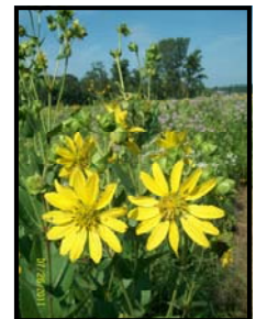
Camphor Weed: this yellow flower is similar to the golden aster, but has wavy leaves that clasp the stem