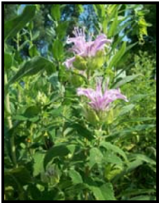
Giant Blue Hyssop: found in thickets and prairies, this 2 to 4 foot flower is quite unusual it has violet blue flowers with 2 pairs of protruding stamens