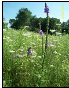
Blue Vervain: this branching, pencil-like plant is filled with small violet flowers that bloom a few at a time