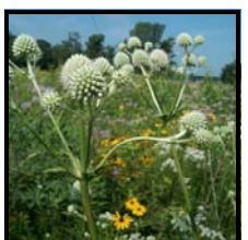
Rattlesnake Master: this unusual plant is part of the parsley family, categorized by round heads filled with tiny flowers and spiny edged leaves