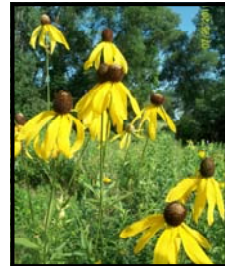
Grey-Headed Cone Flower: sometimes confused as Black-Eyed Susan, this cone flower actually has a grey cone with extremely reflexed petals