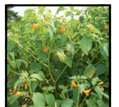
Spotted Touch-Me-Not: this vibrant orange flower hides in wet and shady areas it has a small flower that hangs like a succulent jewel

These are only a few of the wildflowers that Lake Carroll has to offer, there are many more species out there, so we encourage you to search our fields. There is nothing more enjoyable than soaking up the sun and viewing some wildflowers for yourself! If you can identify the two that stumped us, please send their names to webmaster@golakecarroll.com or call 815-493-2552 ext 11.