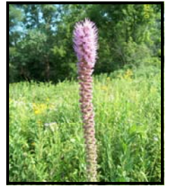
Long-leaved Speedwell: with a tapering design, this tall violet flower stands out in a crowd